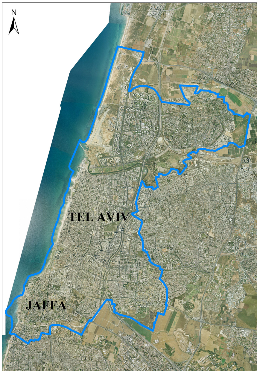
Map 1. Tel-Aviv Jaffa.