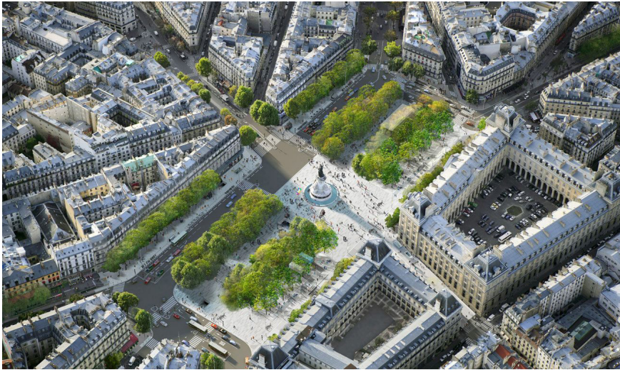
Figure 3. The renovated Place de la République seen from above: a “ grande place populaire ” (great square for the people) for the 21st century?