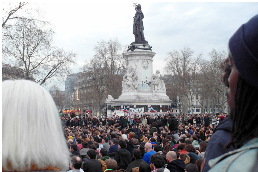
Figure 5. An image of a Nuit Debout gathering on the place de la République with an older woman and a non-White woman wearing a veil looking on from the margins.