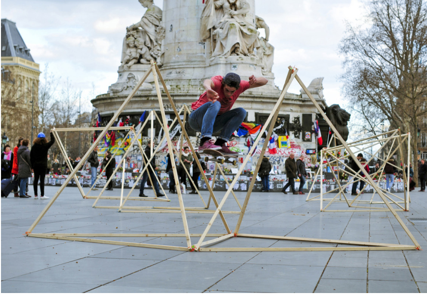
Figure 4. République reinvented as hipster playground. In the background, the shrine to the victims of the 2015 terrorist attacks, at the foot of the statue.