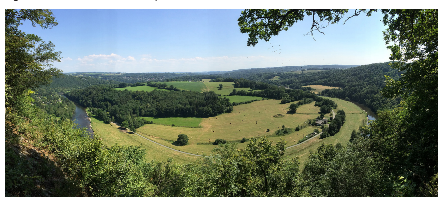
Figure 2. View of the Ourthe loop from La Roche aux Faucons overlook

Since the end of the 19th century, several artists have frequented this loop of the Ourthe to appreciate its picturesque appearance. Intellectual "elites" met regularly in Ham (a hamlet located in the heart of the loop), especially in 1905 for the first organisation of "the tree festival". The history of the designation of the landscape site starts from the 1920s, with the work of the Association for the Safeguarding of the Ourthe loop. Active from 1924 to 1964, its members wanted to preserve the beauty and the silence of the site from pollution and