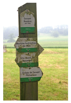
Figure 4. Different assets of the Ourthe loop